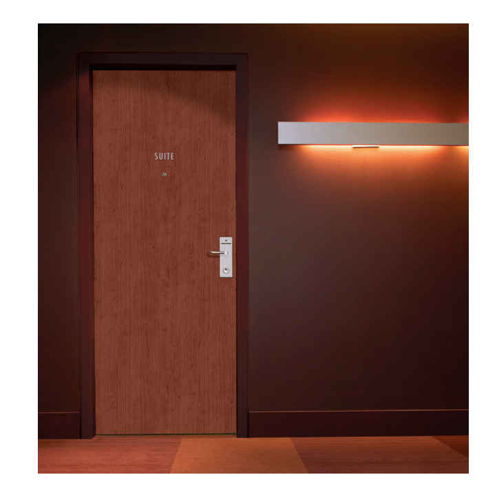
HOSPITALITY Wilsonart Laminate-clad interior doors are perfect for hospitality settings,

At Wilsonart, we believe that doors have to deliver not just function, but style. That's why our customers use tested and trusted Wilsonart® Laminate to provide you with endless possibilities and the design flexibility you not only want, but need for interior doors. So whatever your project, whether it's education, healthcare, hospitality, entertainment, retail, or office environments, Wilsonart Laminate-clad interior doors provide meaningful style and maximum function.