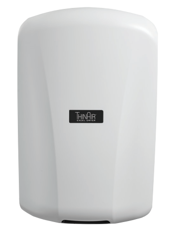
TA-ABS White Polymer (ABS) With SanaFor<sup>™</sup> Antimicrobial Additive