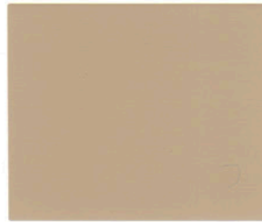
AG 484 BEIGE