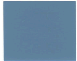
868 OCEAN BLUE