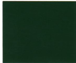
837 RAIN FOREST