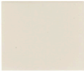
817 POLAR BEAR