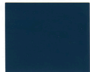
875 BLUE DENIM