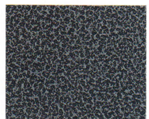
*775 SILVER VEIN