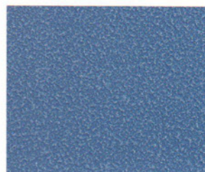
*777 COASTAL BLUE