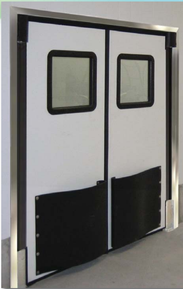
Retailer XHD shown with optional bumpers