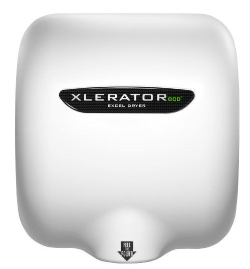
XL-BW-ECO White Thermoset Resin (BMC)