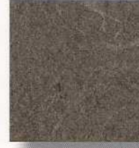
4674 Evening Tigris