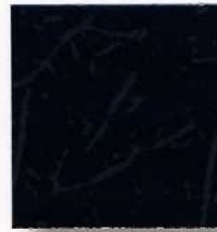
C0-09 Black Craquele*