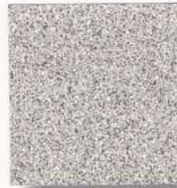
P-705 White Speckle