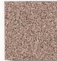
P-887 Beige Grit