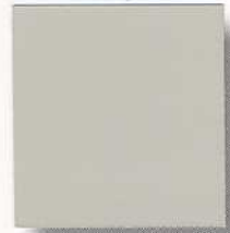
S-431 Willow Grey