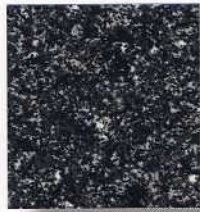
P-500 Black Star