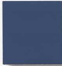
S-513 Denim Blue