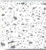
S0-00 Speckled White*