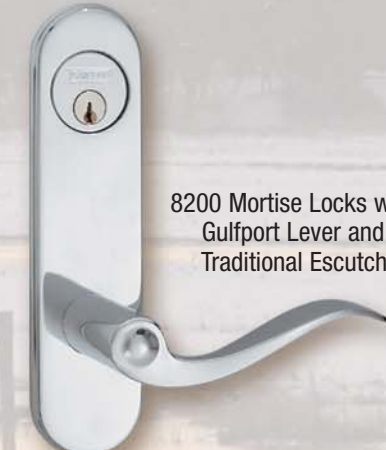
8200 Mortise Locks with the Gulfport Lever and the Traditional Escutcheon