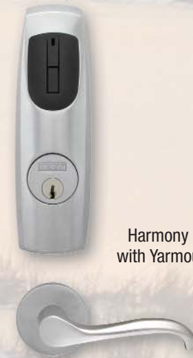
Harmony Series™ with Yarmouth Lever