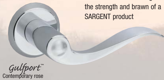
Gulfport™ Contemporary rose

The look and feel of elegance – the strength and brawn of a SARGENT product