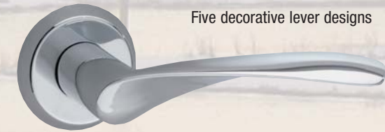
Sanibel™ Contemporary rose

Each lever, escutcheon and rose is of a solid cast or forged construction