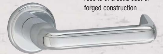
Coronado™ Traditional rose

Each lever, escutcheon and rose is of a solid cast or forged construction