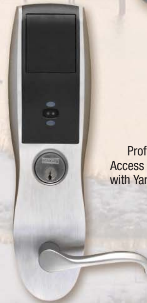
Profile Series Access Control Lock with Yarmouth Lever