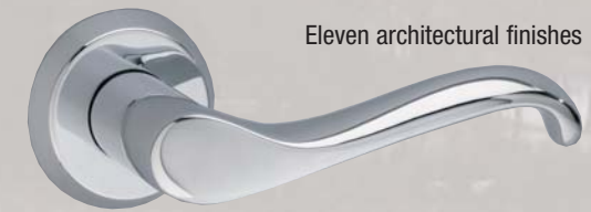
Yarmouth™ Contemporary rose