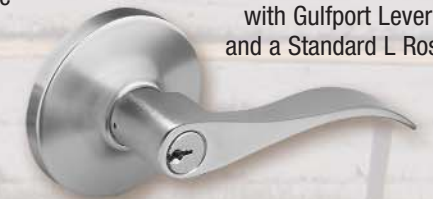
10 Line Bored Locks with Gulfport Lever and a Standard L Rose