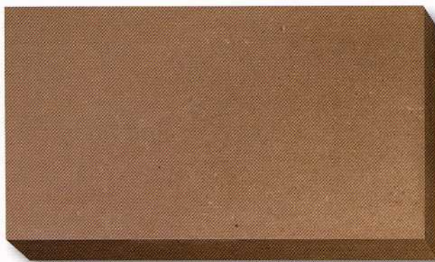
SC02 Desert Beige