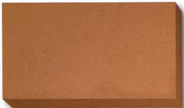
SC03 Terra Cotta