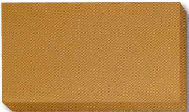
SC01 Golden Khaki